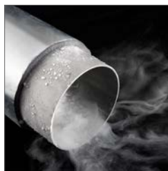
Cryogenic and dual-temperature

ArmaGel XGC. The next generation of cryogenic and dual-temperature aerogel blanket technology. Flexible, improved work safety. Cryogenic conditions down to -196^{\circ}\text{C} ( -321^{\circ}\text{F} )*. ArmaGel XGC is the reliable solution for cryogenic and dual-temperature applications.